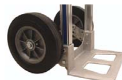
14 x 7 Nose Plate