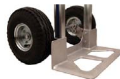
18 x 7 Nose Plate (Has Wheel Gaurds)